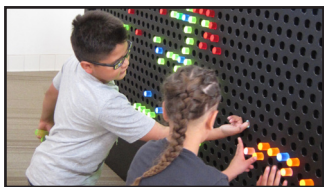
Field Trips-page 6