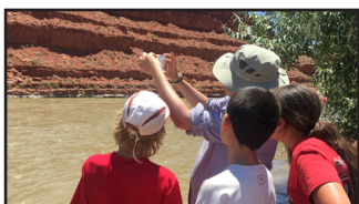
Citizen Science-page 10