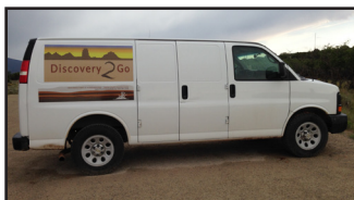
School Visits-page 7