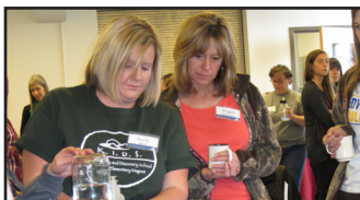
Teacher Development-page 8