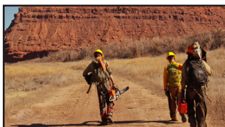
Youth Corps-page 9